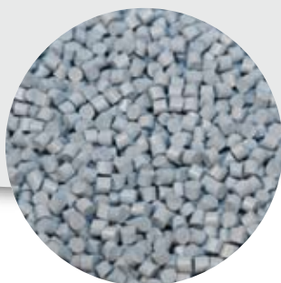
E.G. GREY GRANULES