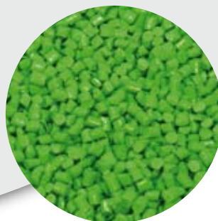
E.G. GREEN GRANULES