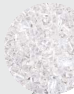
E.G. UV STABILIZERS