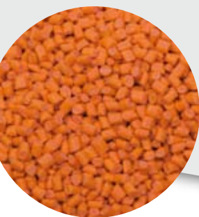
E.G. ORANGE GRANULES